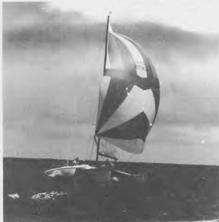
KILLER FROG — photo taken by Butch Hitchcock on MYSTERY

By Midnight they had arrived at 25 to 30 knots and 3 to 6' waves. Full sail was up, boat speed unknown, as KILLER FROG's log was kaput and the replacement was connected inside the cabin. Mark, offwatch, was trying to sleep.