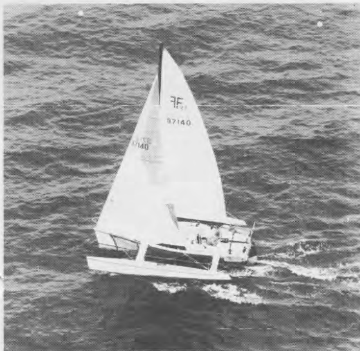
KILLER FROG off Catalina.

The morning of day 4 finds us once again under main alone as we want to thoroughly inspect both spinnakers in daylight before risking them with some 1700 miles to go. Morning also shows we have come far enough south and given up enough ground to have a couple of 40 footers on the horizon ahead