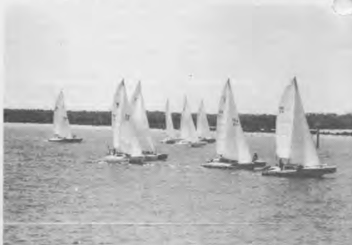
A start during the last Australian Trailertri Nationals in Bundaberg.