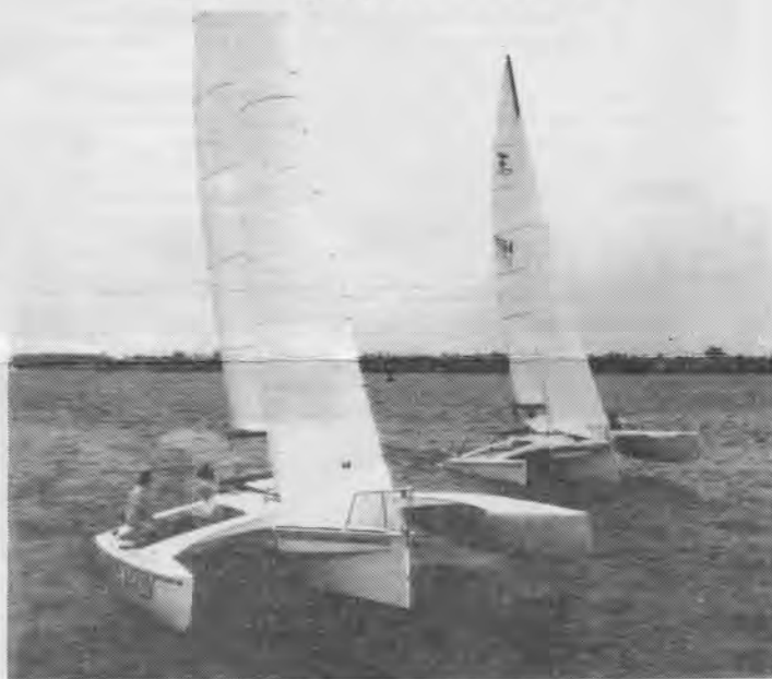
DO IT AGAIN and SUPER FOX together on San Diego Harbor

Ten minutes behind us, the big Ultra-Light and IOR A class