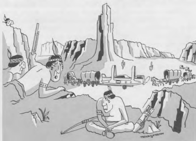
Alright, stop sulking, you can have the F27

Trailertri is compiled and published by Ian Farrier with 4 issues every year. Publication date for each issue depends on the availability of suitable material, but will usually occur in December/January, March/April, June/July, and September/October. Subscription is US$6, A$10, NZ$12 and all other foreign US$7. Subscription includes airmail postage and personal checks are accepted in all above currencies. Send all subscriptions to Ian Farrier, P.O. Box 7362, Chula Vista, CA 92012. Ph. (619) 585 3005.