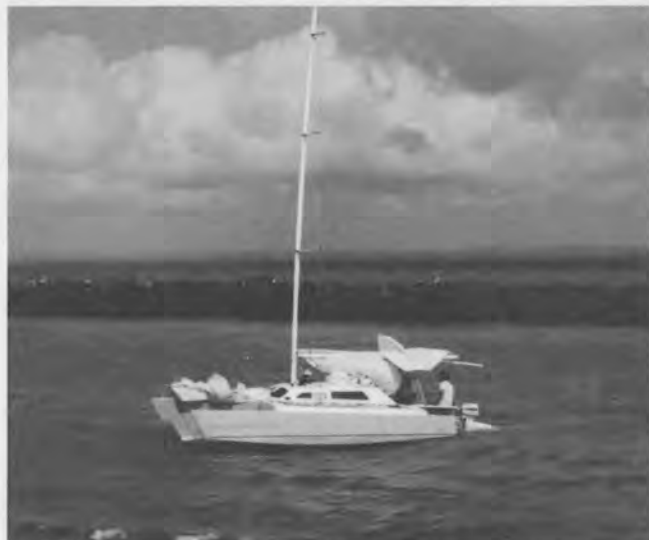
Doug Trott's Trailertri 720 KNEE TREMBLER